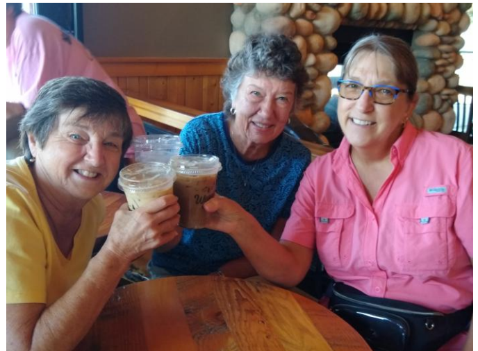
WOI Walk and Talk Group enjoying Boulevard Park and Woods Coffee