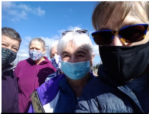
WOI Ladies enjoy a "walk and talk"

Women of Immanuel Quilting is happening again on Thursdays at 9:00 a.m. in the Parish Hall. All are welcome!